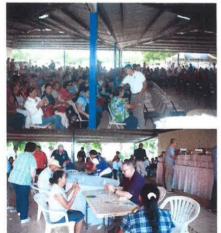
Mexico in 2016 screenings were inside and crowds again waited each day for their chance for eye glasses. Missouri Lions went on a

Crowds waited for doctors every morning in 90 degree heat. Screenings were held in an outdoor pavilion. Local Lions provided seating and crowd control.