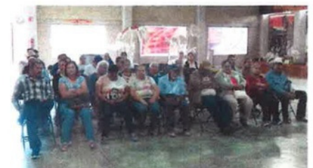
Mexican mission again in 2017. Every participant returns with stories of the joy and thanks expressed by those they've help regain