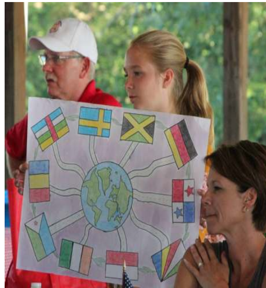
East Perry County Lions