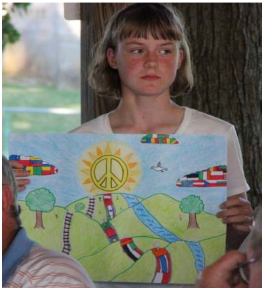
East Perry County Lions Peace Poster winner #1