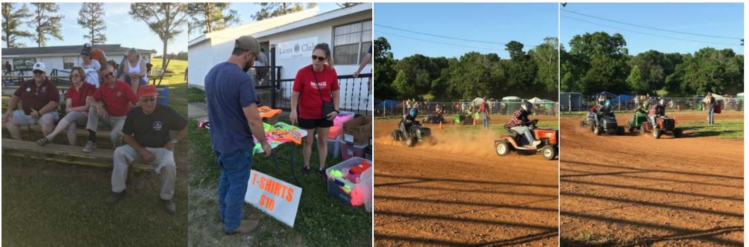
Patton Lions Club holds Lawn Mower races

Patton Lions club opened its much-delayed season of lawn mower races Saturday June 13. Over 50 competitors brought their "racing mowers" to the track and entertained an enthusiastic group of spectators. Turnout was a little lower than usual as this was the club's first race of the year, the COVID-19 restrictions having resulted in the cancellation of all April and May events. Patton Lions members expect the spectator count to return to near normal for the next event, which will also feature a fireworks display. The lawn mower races are the club's biggest fundraiser, and there will one again be a nationally sanctioned mower race this fall!