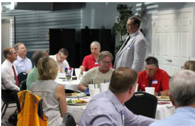
Sikeston Lions Club June membership drive event