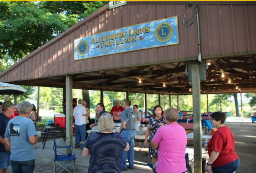
East Perry County Lions Club at Altenberg anniversary meeting