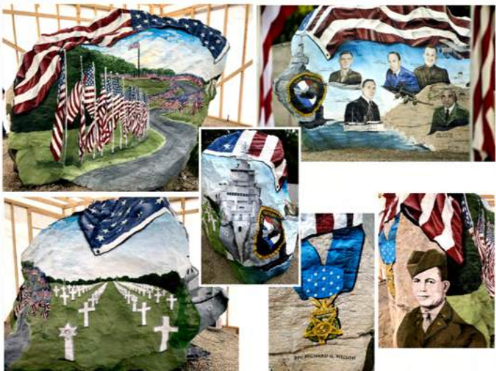
CAPE GIRARDEAU FREEDOM ROCK © © RAY "BUBBA" SORENSON II