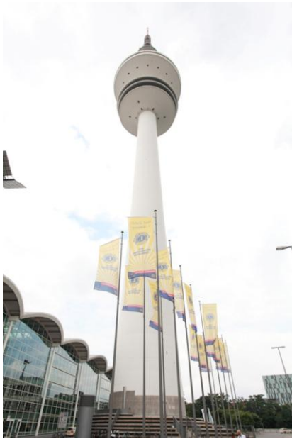
“Welcome LCI” Hamburg, Germany