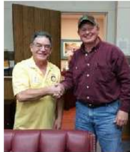
Houston Lions treat local police to lunch