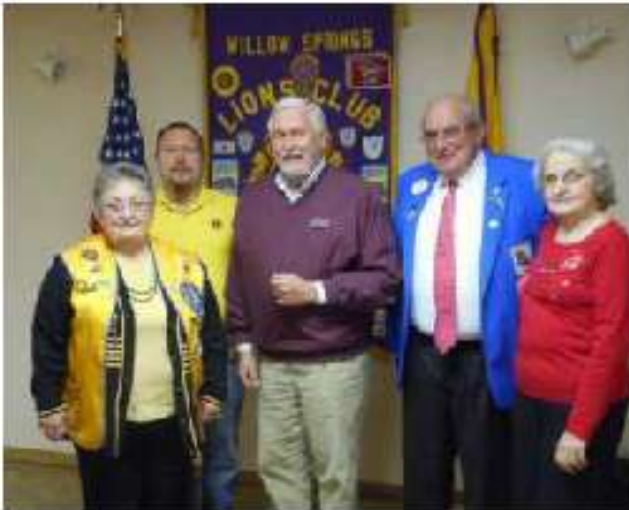
Blind Student attends Cape Girardeau Lions Meeting