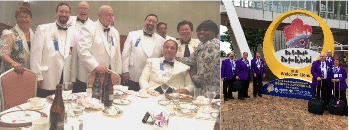
Pictured above (left) MD 26 DGE's celebrate graduation from their training class in Fukuoka, Japan.